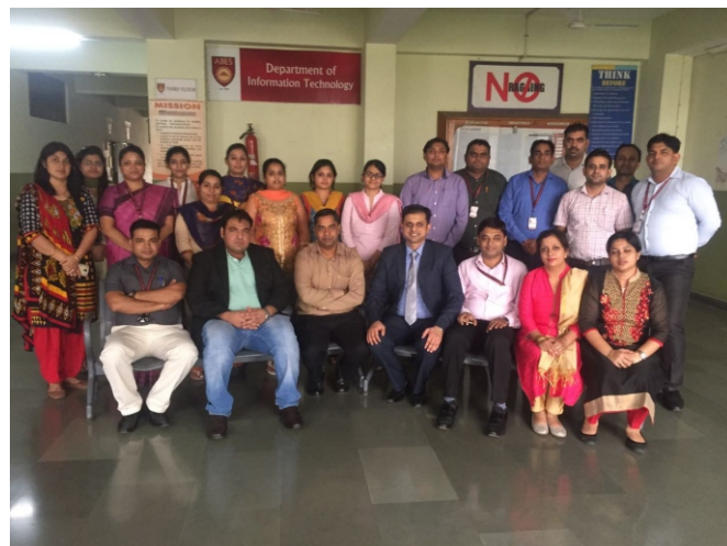
Department of Information Technology with Alumni