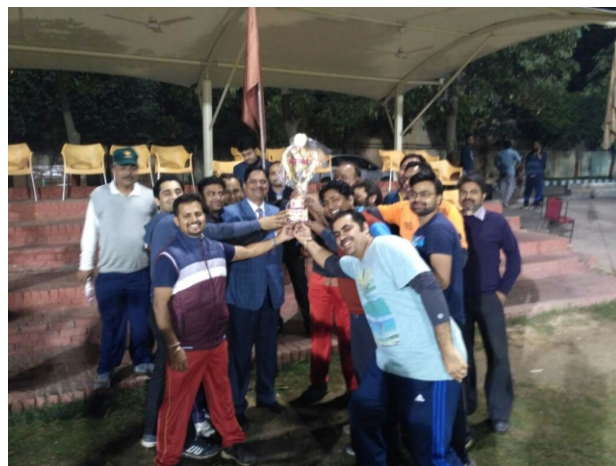
Trophy sharing by the faculty members, Department of Information Technology