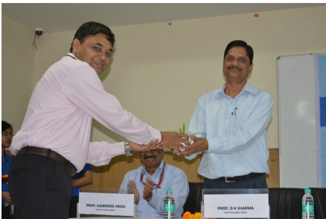
ACM Student Chapter Celebration