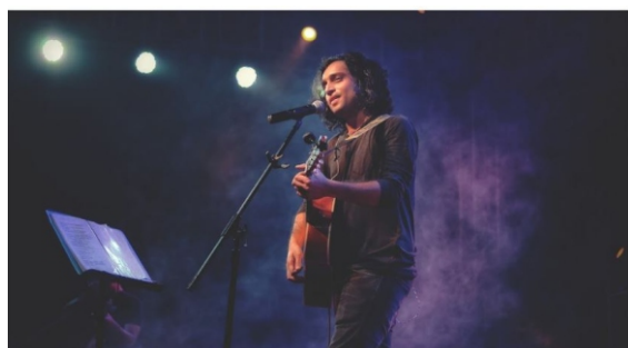
Star Night, Genero'17